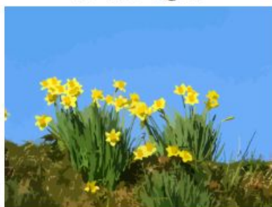
Nilasha Reddy 2018

Dreaming of sunrise Walking in spring Flowers blooming Fog was cleared Opening their eyes to see the weather Drinking smoothies In the light