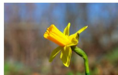
Danica Combrink 2018

Daffodils Are Flipping Flopping Over dirt In Lily's